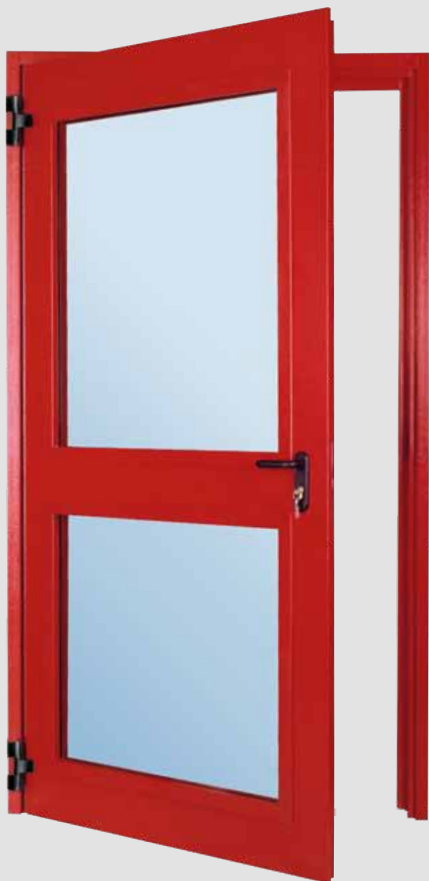
Porta Novoglass REI 60 ad un'anta, lato tirare. Novoglass one leaf glazed door, pull side.