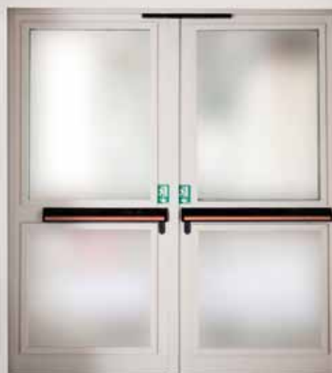
Porta vetrata Novoglass REI 60 a due ante, maniglioni Novopush. Novoglass REI 60 glazed door two leaves.