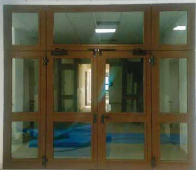
Vetrata complessa Novoglass REI 60 a due ante, lato tirare. Novoglass REI 60 complex glazed door, pull side.